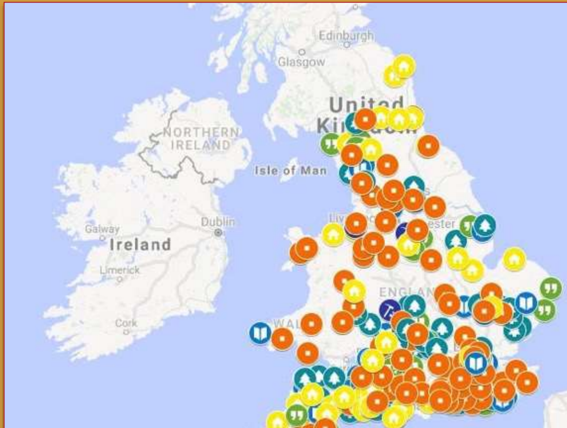
CLTs Nationally 2018