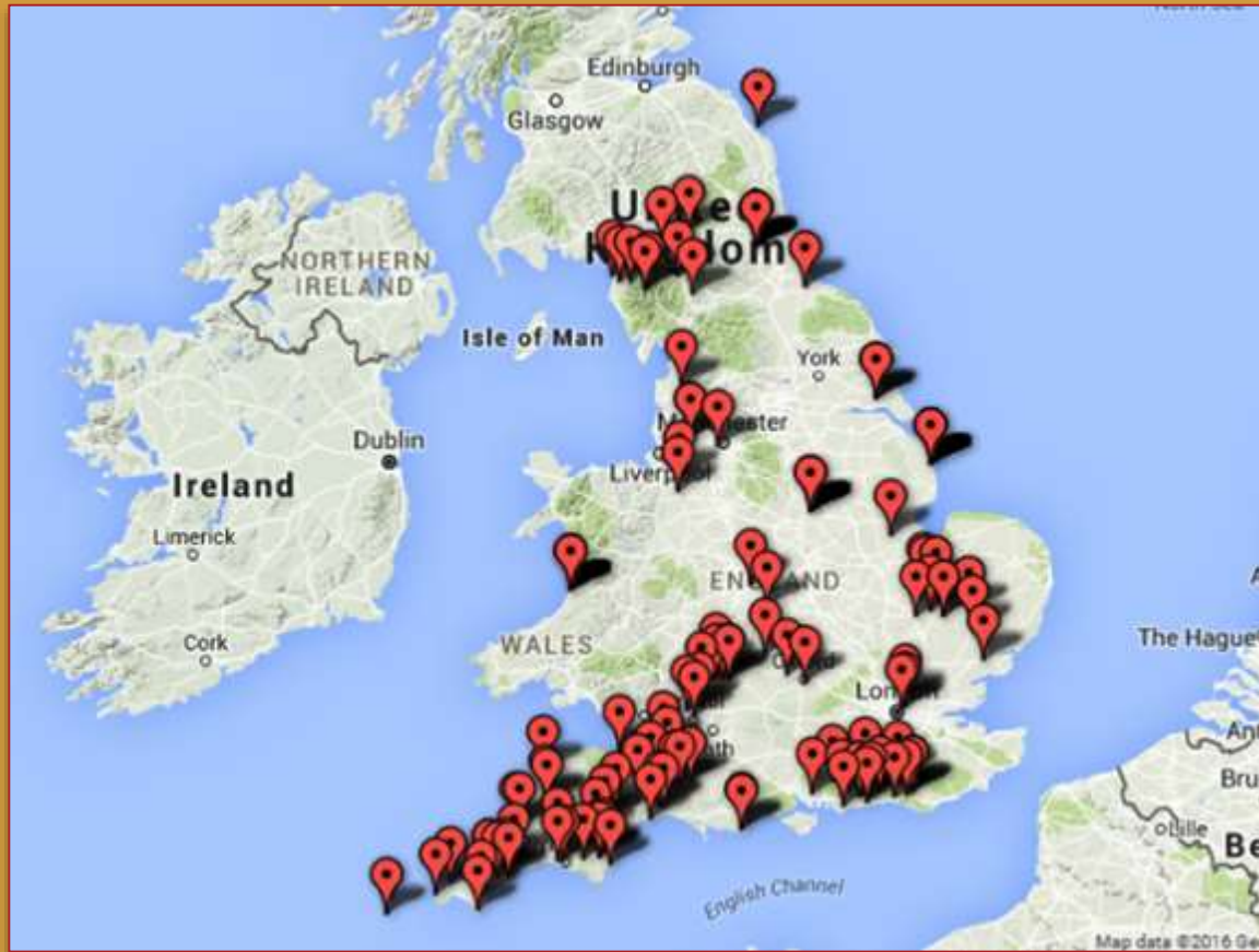
CLTs Nationally 2016