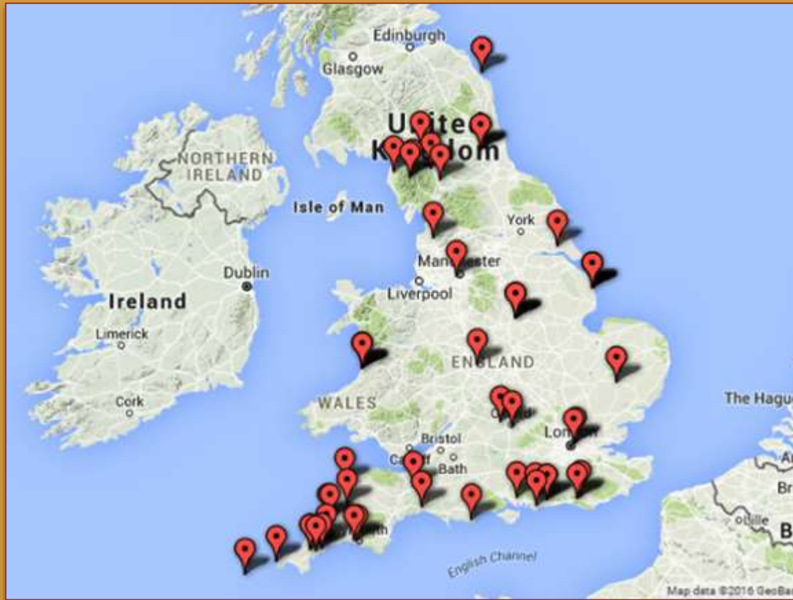
CLTs Nationally 2010