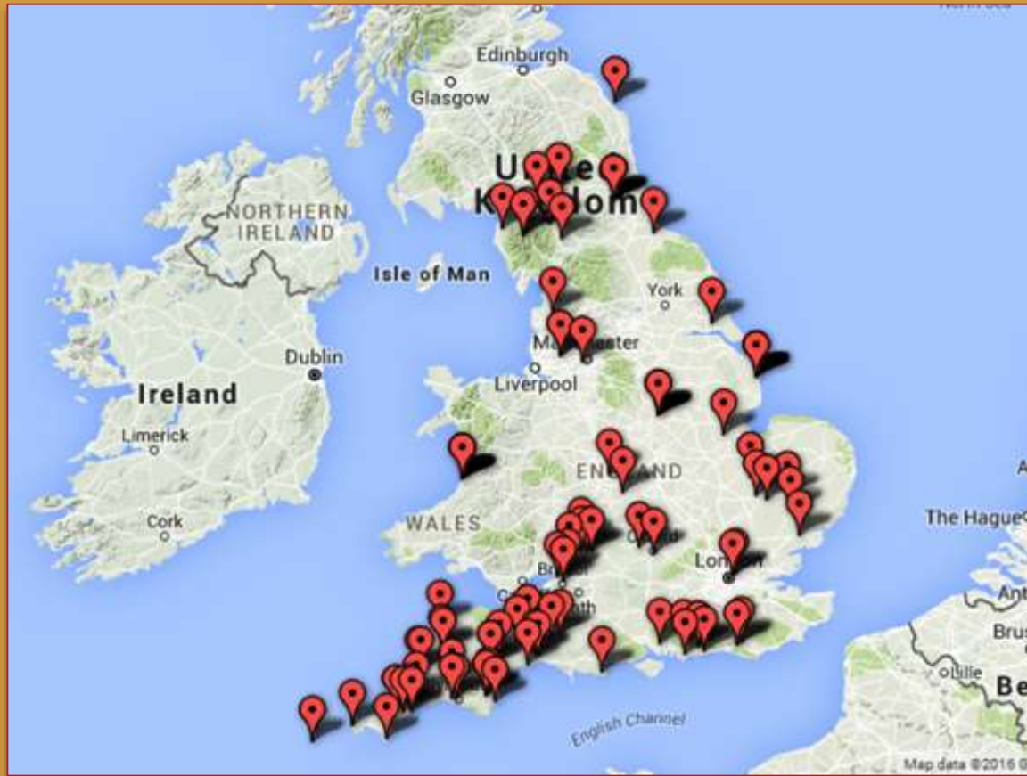
CLTs Nationally 2013