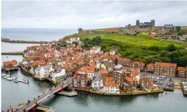
Whitby residents have voted overwhelmingly for curbs on second homes.

Labour MP Luke Pollard says Covid-19 has 'turbo-charged' housing crisis in rural and coastal towns