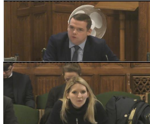
Scottish Affairs Committee Monday 23 January 2023 Meeting started at 3.00pm, ended 4.31pm

What steps her Department is taking to help ensure the continuity of terrestrial television coverage.