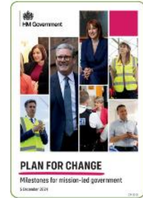
A Rural Specific Plan

Campaigning for a fair deal for rural communities