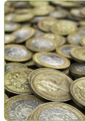
Fairly Funded Rural Public Services