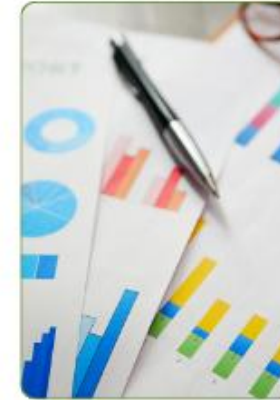
Use of the right measures & metrics to understand rural Challenges