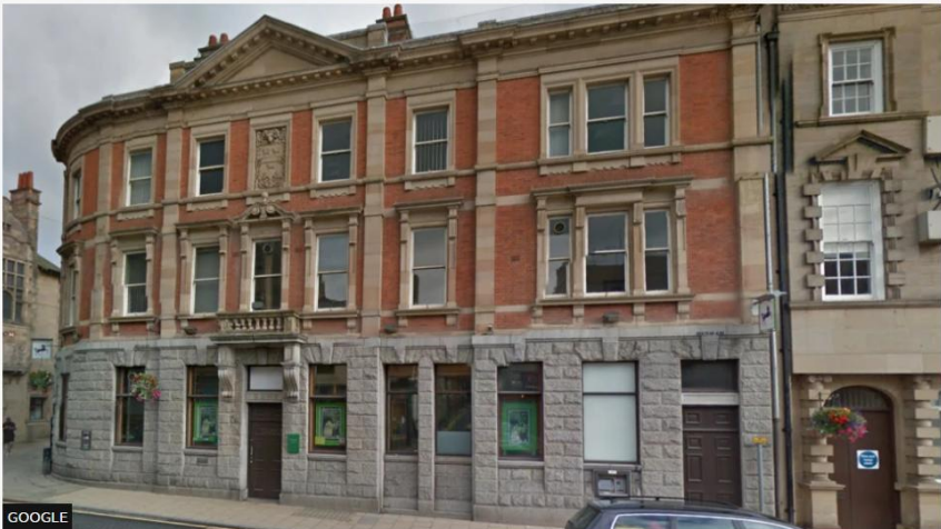
Across the country, more than 130 Lloyds, Halifax and Bank of Scotland branches are set to close.