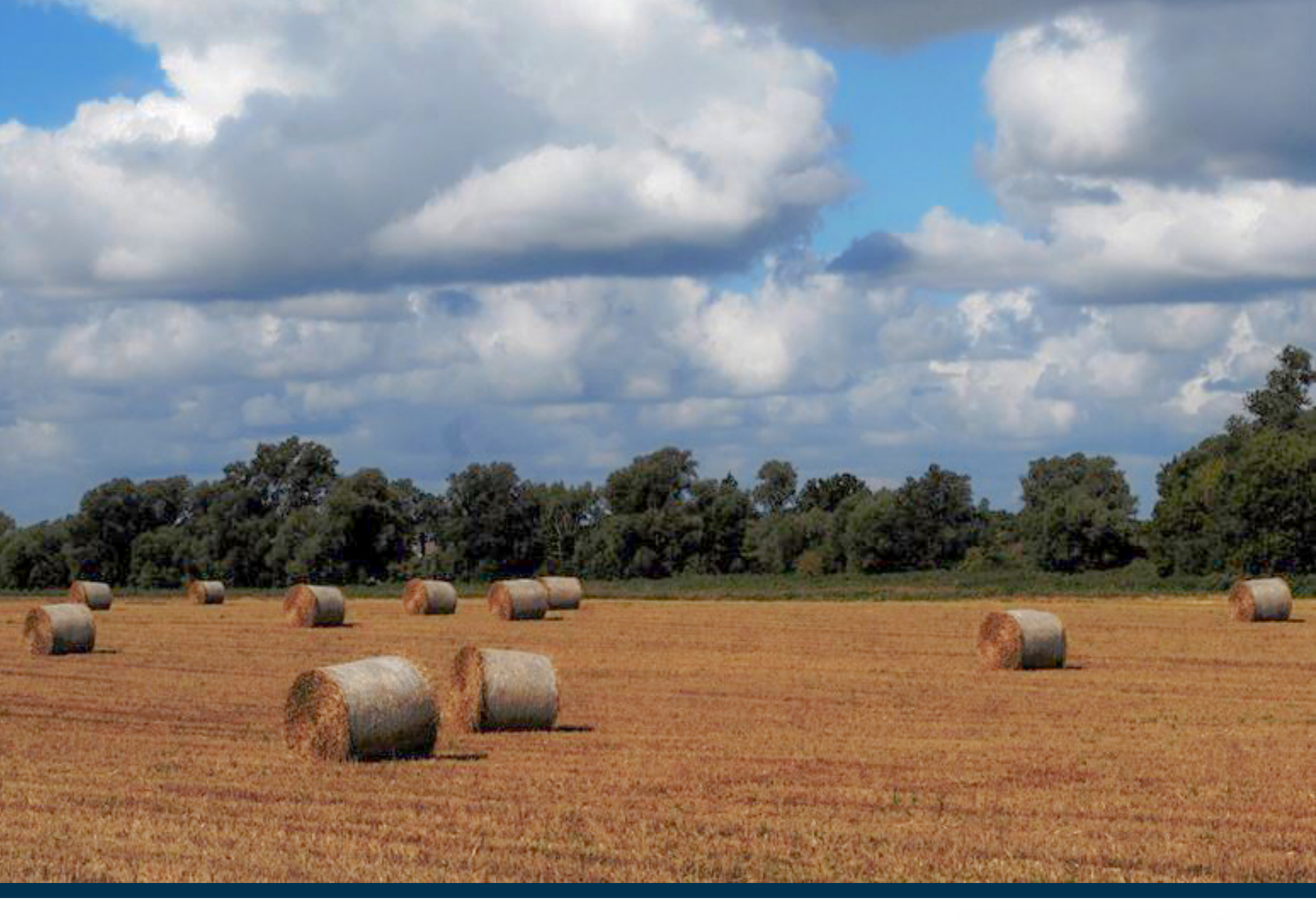
Putting you first