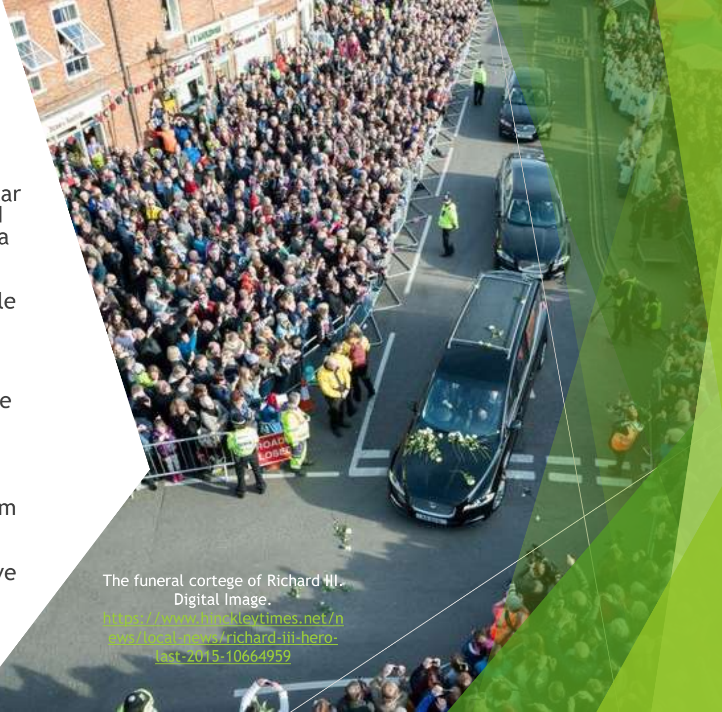
The funeral cortège of Richard III. Digital Image. https://www.hinckleytimes.net/news/local-news/richard-iii-hero-last-2015-10664959