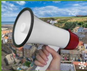
Elevating Rural Voices: RSN's Year of Impact