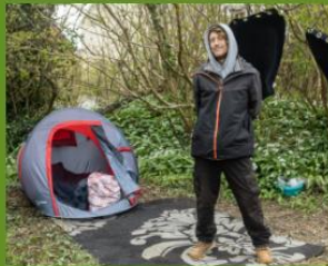
Call for Urgent Investment in Rural Housing as Crisis Grows