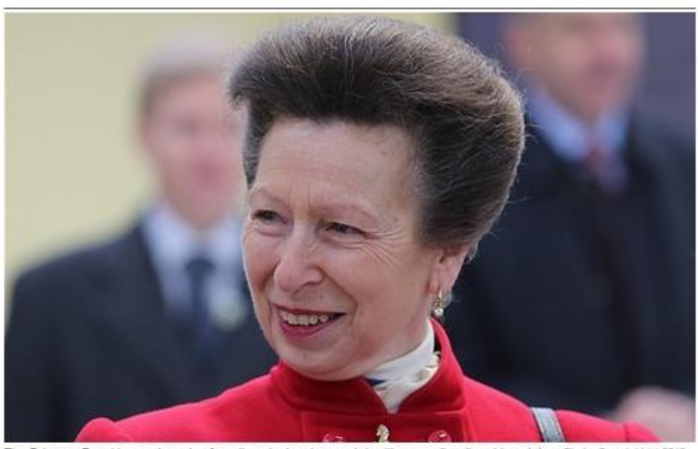
The Princess Royal is an advocate of small-scale developments in villages, rather than big estates.

Princess Anne advocates building houses in villages, rather than 'large scale' developments, to solve rural home shortage