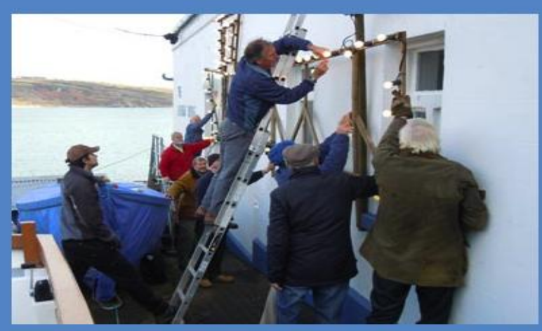
Christmas Lights Team at Work 21st November 2012