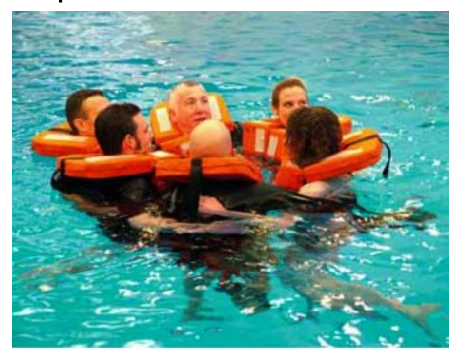
▲ Safety training for fishermen