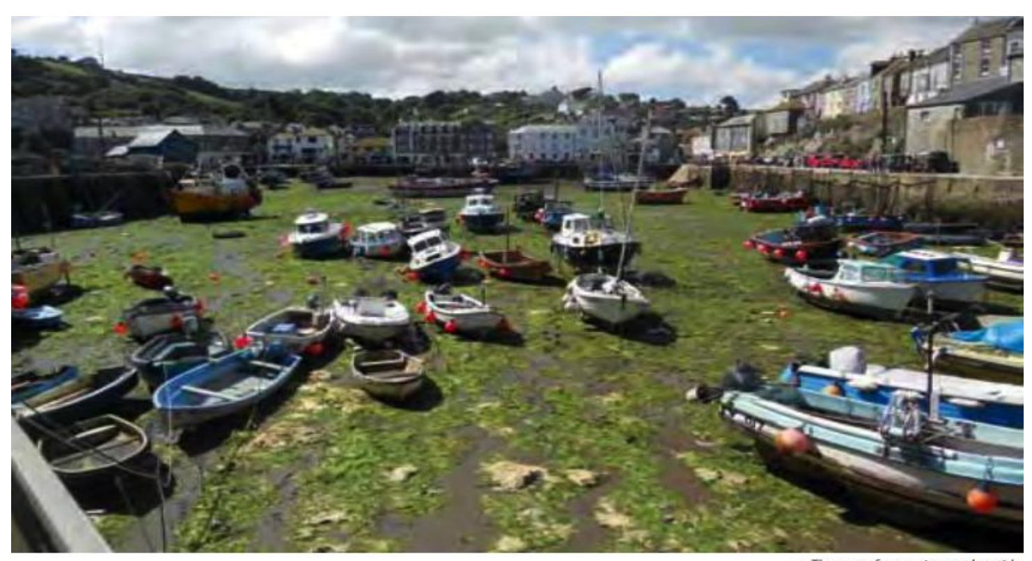
▲ The port of mevagissey at low tide.