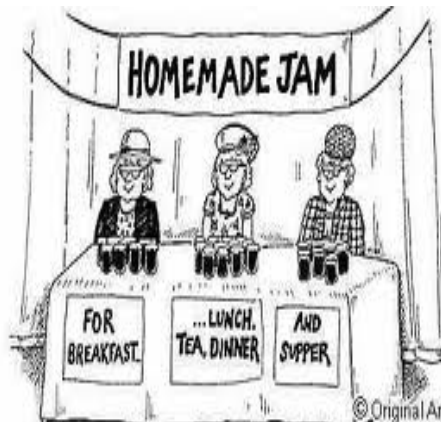
© Original Art Reproduction rights obtainable from www.CartoonStock.com